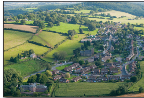
Littledean, one of the ancient villages of the Forest of Dean.