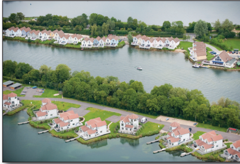
New housing on old gravel pit lakes, South Cerney, in the heart of the Cotswold Water Park.