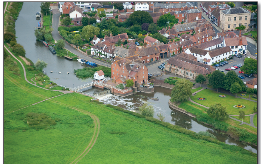
Tewkesbury was a flour-milling town for centuries.