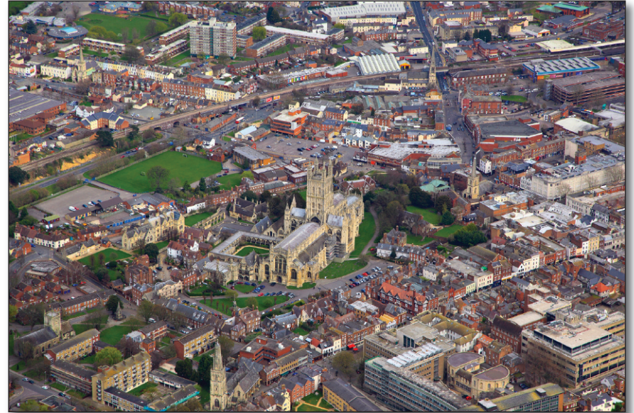
Gloucester, the county town, is dominated by the soaring mass of the cathedral, ringed by other churches.